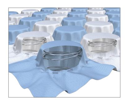
Alternating coil design