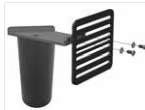
Headboard brackets included with mounting hardware kit