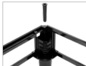
Quick-connecting interlocking corner system