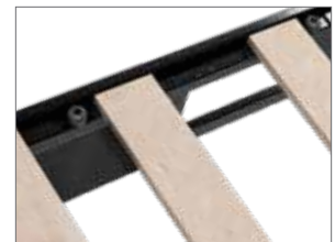
Sturdy roll-out slats with rubber stops