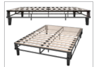
Dual center supports on King and Cal King sizes. Single on Queen, Full, TXL, and Twin