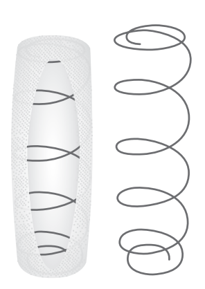
Pre-compressed coils surround the perimeter